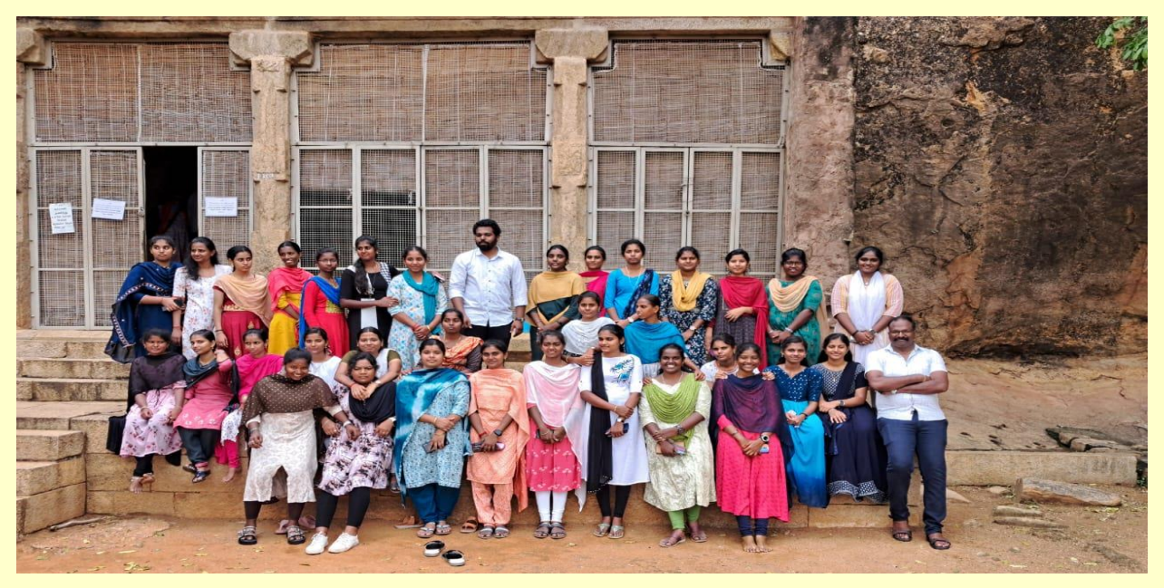
As a Part of B.Ed., Curriculum the students and faculty members of Sakthi Institute of Teacher Education and Research & Sakthi College of Education for Women had visited Munnar, Kochi, Ernakulam in the Kerala state on 4<sup>th</sup> and 5<sup>th</sup> April 2024.

As a Part of B.Ed., Curriculum the students and faculty members of Sakthi Institute of Teacher Education and Research & Sakthi College of Education for Women had visited Chittanavasal, Pudukottai and its surroundings on 19<sup>th</sup> January 2024.